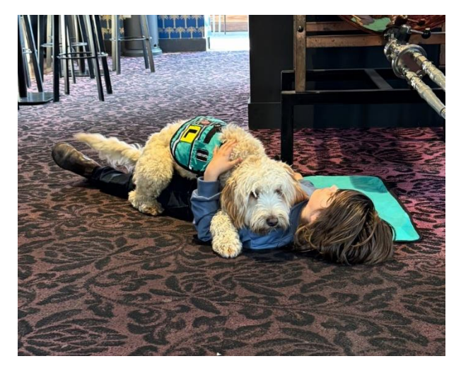
Image id: A child laying with their back on pink and black, floral-patterned carpet. A medium sized, beige colour dog lays on top of the child with its face resting on their shoulder. The dog is wearing an aqua colour jacket with a yellow and black 'L' indicating it is a learner assistance animal.

Before moving on to part 2, CYDA would like to share two images of assistance animals at work. These have been shared with permission of the children and their caregivers who participated in our focus group.